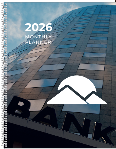
7020 Large Standard Monthly Planner - Spiral Bound