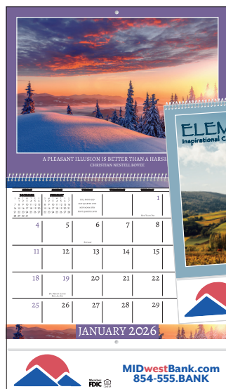
1955 Elements Appointment