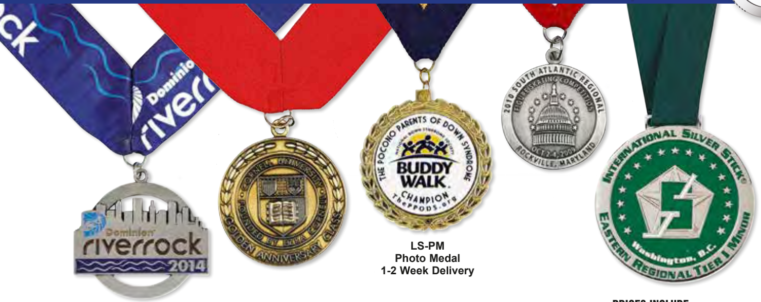
LS-PM Photo Medal 1-2 Week Delivery