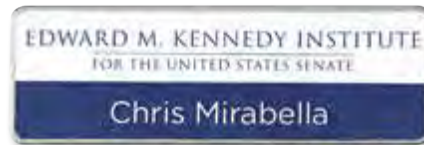
3" x 1"