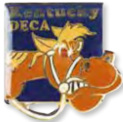
Blinking Light Pin