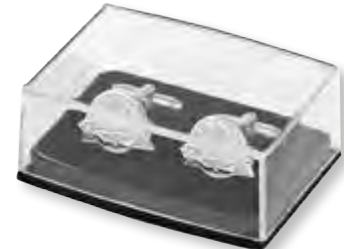
Plastic Cuff Link Box