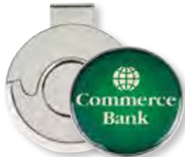
Hat Clip w/Magnetic Ball Marker