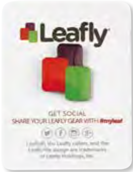
Printed Card in Poly Bag