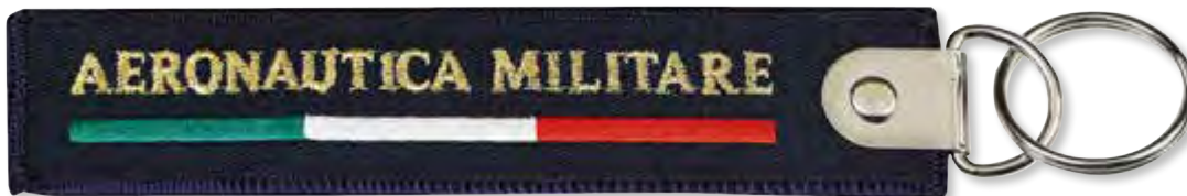
Embroidered Bag Tag Price Upon Request