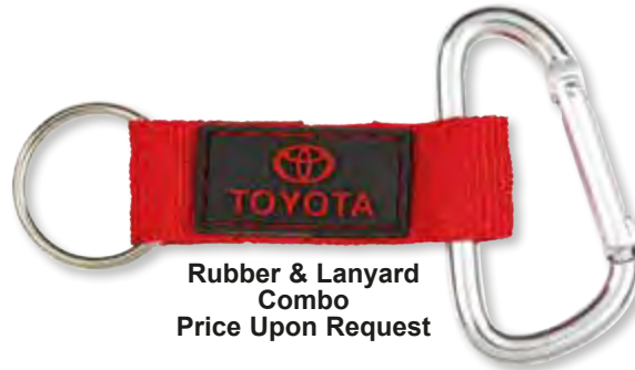
Rubber & Lanyard Combo Price Upon Request