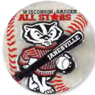
Custom 2 Piece Baseball Pin