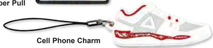
Cell Phone Charm