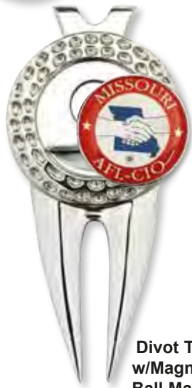
Divot Tool w/Magnetic Ball Marker

Great for golf outings and corporate functions. LS-DT, LS-HC, LS-BT