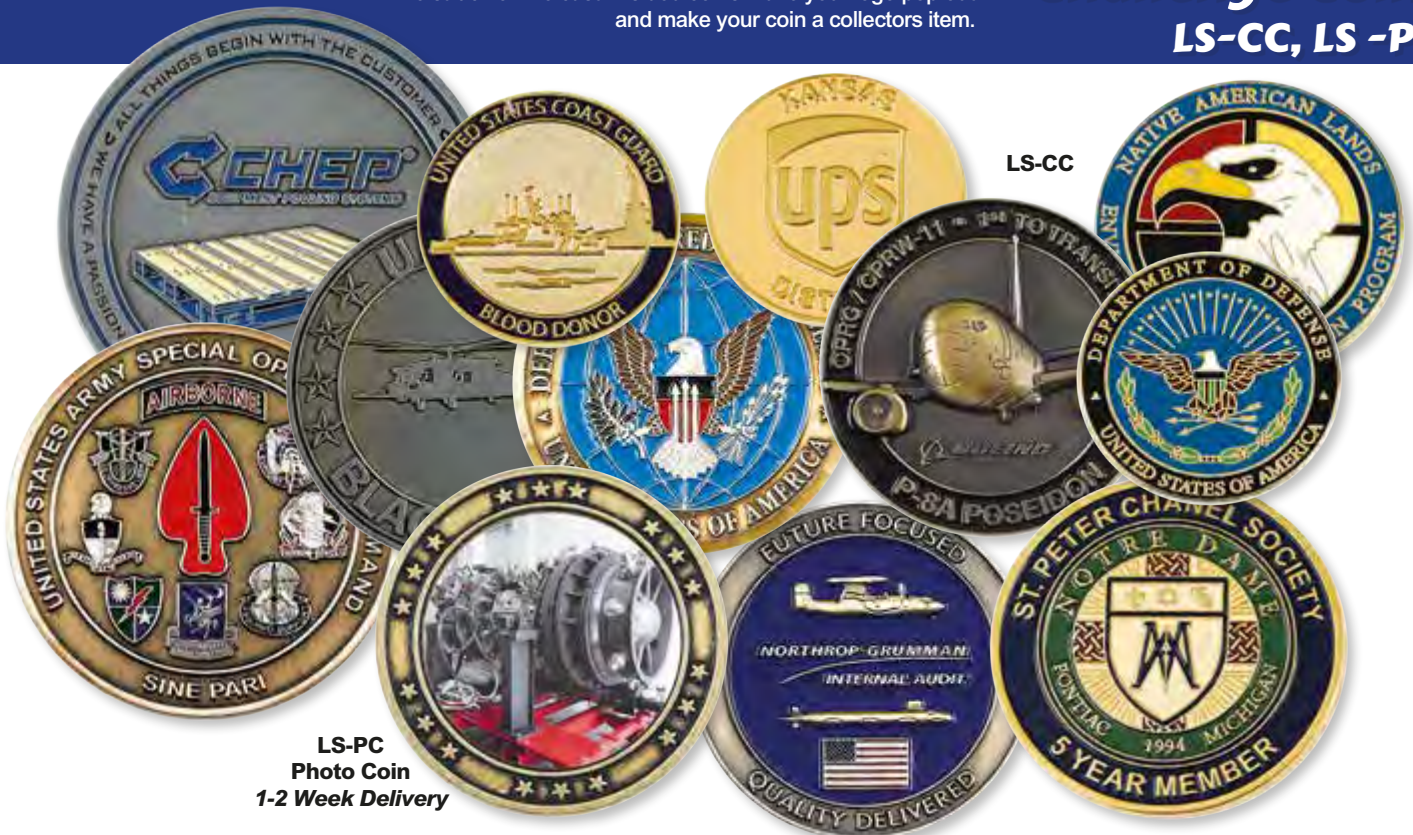
LS-PC Photo Coin 1-2 Week Delivery