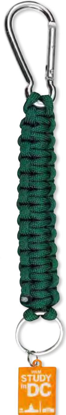
Parachute Ribbon Price Upon Request