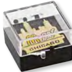
Small Plastic Box