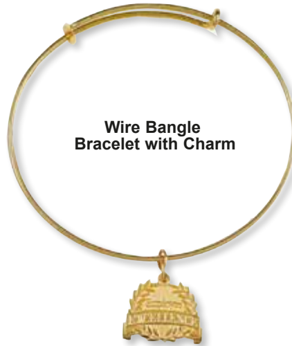
Wire Bangle Bracelet with Charm