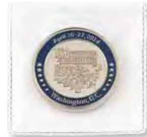
Vinyl Coin Pouch