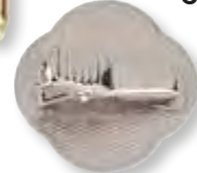
Small Alligator Clip