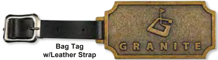
Bag Tag w/Leather Strap