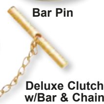
Deluxe Clutch w/Bar & Chain