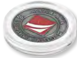
Plastic Coin Case