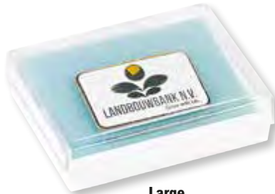
Large Plastic Box