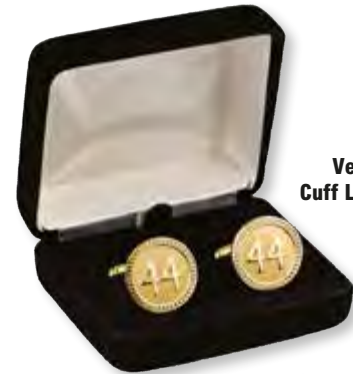
Velvet Cuff Link Box