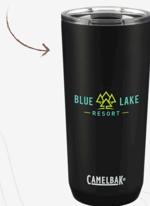
CAMELBAK® TUMBLER 200Z | 1627-37 As Low As: $28.50[e]