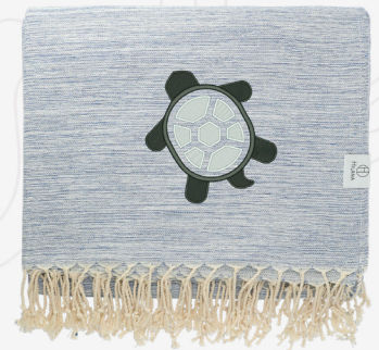
HILANA UPCYCLED YALOVA ULTRA SOFT MARBLED BLANKET | 1081-85 As Low As: $59.97[d]