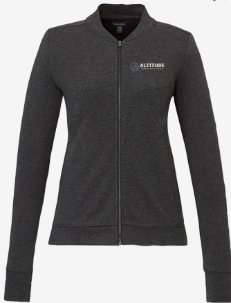
RIGI ECO KNIT FULL ZIP | TM98157/TM18157 As Low As: $58.67[c]

perfect for layering - breathable & moisture-wicking