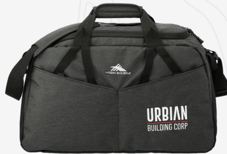
HIGH SIERRA® FORESTER RPET 22" DUFFEL | 8052-48 As Low As: $49.98[d]