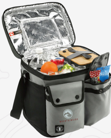
ARCTIC ZONE® REPREVE® 24 CAN DOUBLE POCKET COOLER | 3860-78 As Low As: $54.75[d]