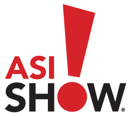
CHICAGO McCormick Place